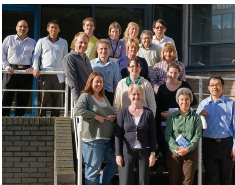
The research team at the Centre for Endocrine and Diabetes Sciences