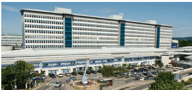
University Hospital Wales